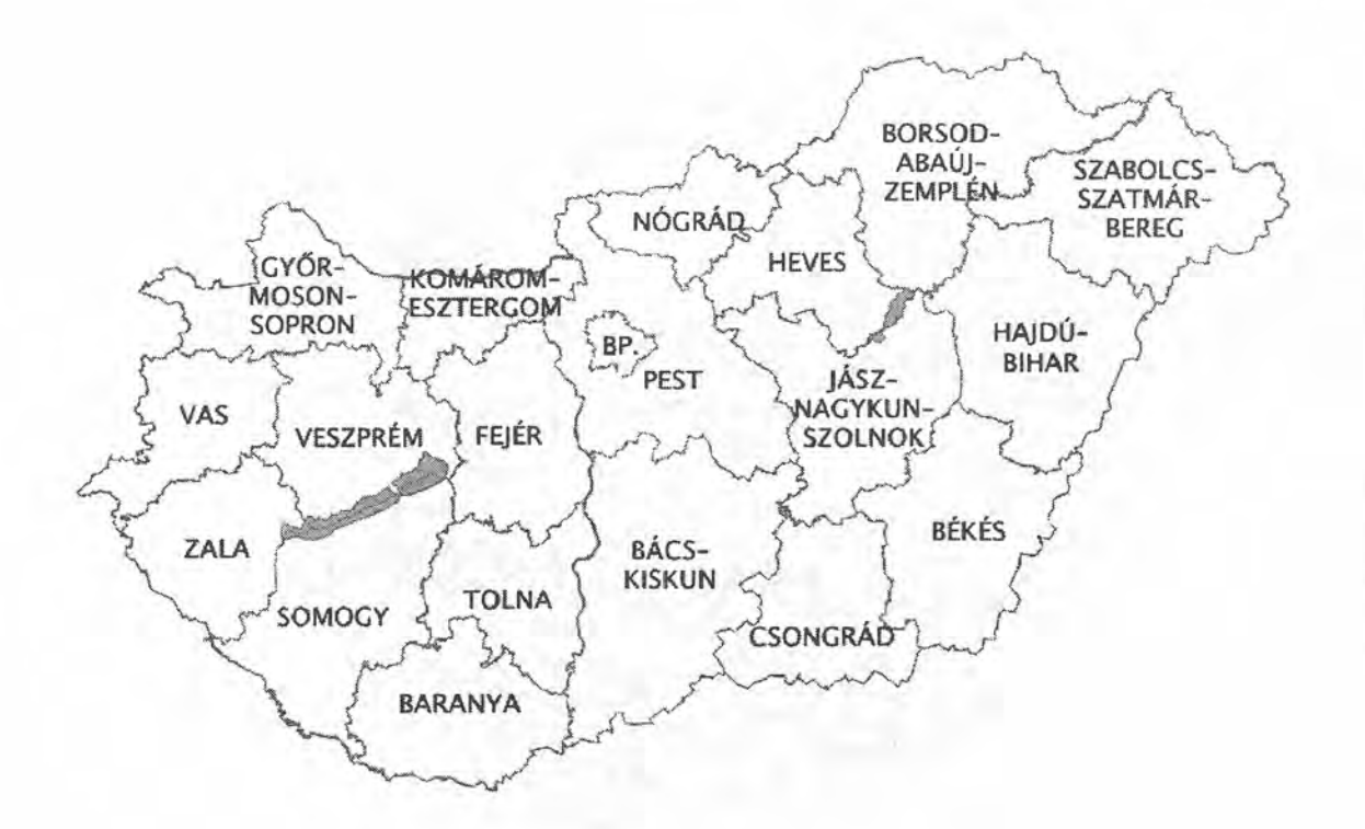
Map 2: Present-day Hungary