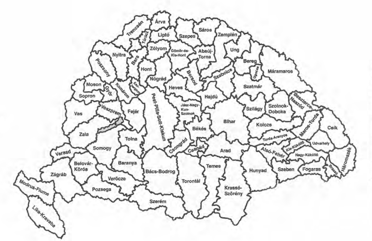
Map 1: Pre-Trianon Hungary